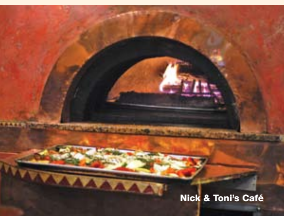
Nick & Toni's Café

Relaxed, elegant, sophisticated. Expect jewel tones in early fall — hot chili, dark pumpkin and garnet. The lavenders and purples of October will complement what you bought in September. And don’t forget the basics — grays, browns and blacks. The mantra is layer, layer, layer — leggings, tanks, tunics, skirts, skinny pants, cardigans, accessories and, to complete the outfit, embroidered and crinkled scarves. European devotees flock to the TWC store to purchase their seasonal wardrobes. You should too!