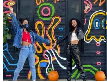
Black Village Arts by Brandi Jones 147 Flushing Avenue, Brooklyn -> Community Art