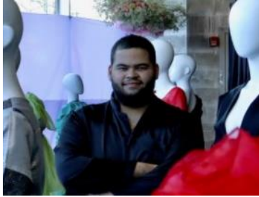
FINEZI by Edwin Reyes 1 Fordham Plaza, The Bronx -> Handmade Clothing